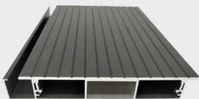
RAL 7016 Anthracite Grey Standard

Aesthetically pleasing the A2 fire rated aluminium decking is also suited for offsite manufacturing, it comes with a 25 year warranty and is your premier choice for non combustible decking.