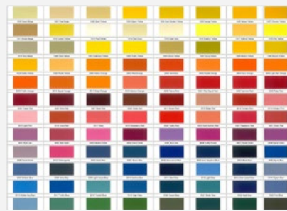
Any RAL colour available