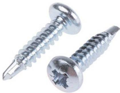
DECK BOARD SCREWS Self tapping 4.2 x 12mm

Proactive 600 Fire Rated Class A2 Decking (fully recyclable) JOIST SPAN - 600mm